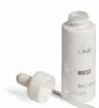
MELINE ® 03 Moist