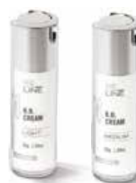
MELINE ® 04 B.B. Cream