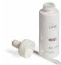
MELINE ® 03 Moist