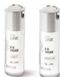
MELINE ® 04 B.B. Cream